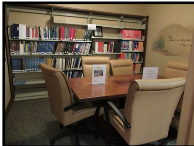
Dubois Genealogy Room