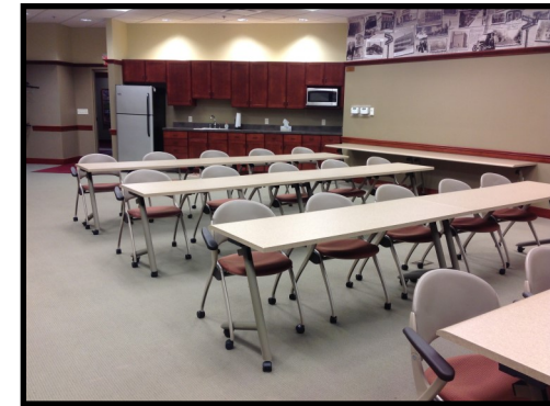
Ferdinand Community Room