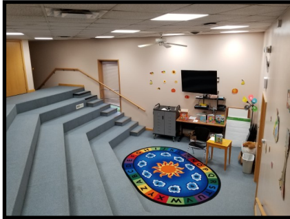
Jasper Library Theater