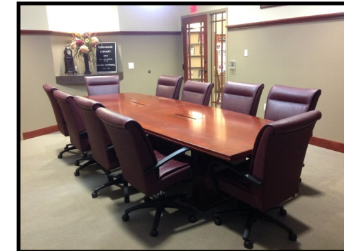
Ferdinand Conference Room