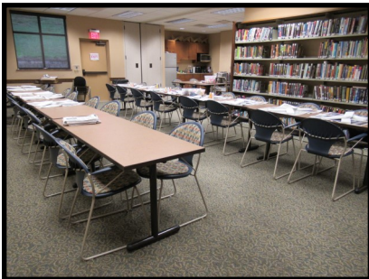
Dubois Community Room